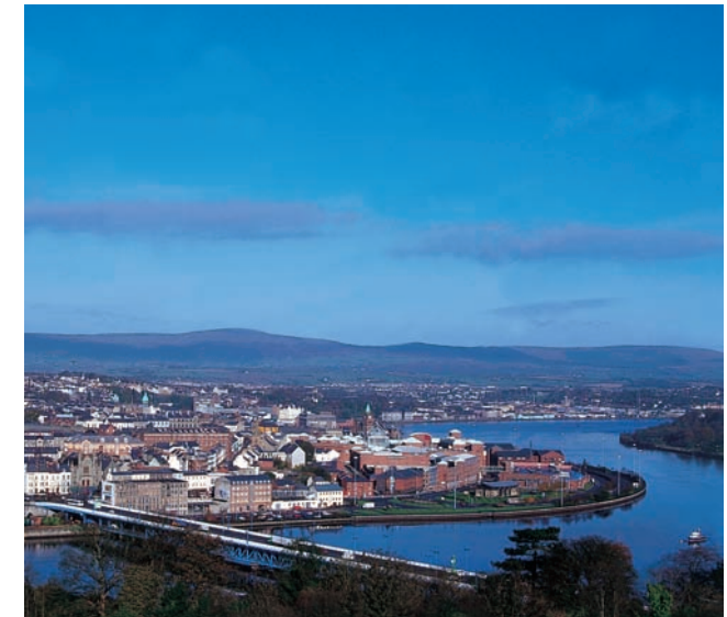
View of Derry City

A gentle circular route for cyclists runs between the Learmount Community Centre and the castle, whilst elsewhere several waymarked walks follow the banks of the Faughan.