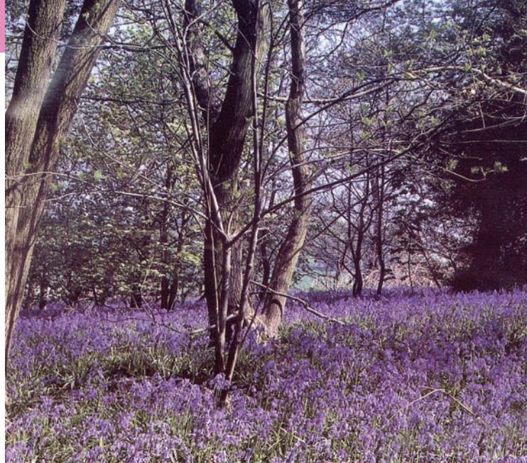
The Bluebells at Learmount Forest

Ness Wood Country Park covers an area of 50 hectares of mixed woodland. The park derives its name from the spectacular waterfall, which is the highest in the Province. The Irish 'an las' anglicised as 'Ness' means waterfall. Cycling is permitted in the park on the vehicular roads.