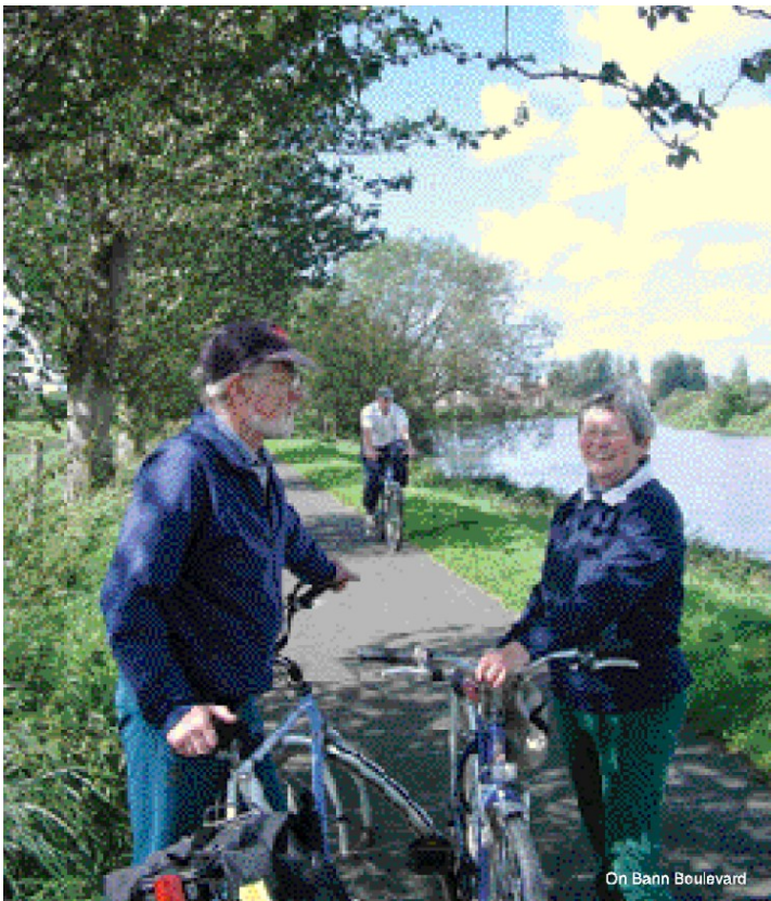
On Bann Boulevard

The Craigavon Cycle Trail is a thirty-five mile cycle ride through the Borough of Craigavon linking inland waterways, the shores of Lough Neagh and picturesque villages. The level, traffic-free sections through City Park and the Newry to Portadown Canal are suitable for family or novice cyclists whilst the undulating countryside of County Armagh offers magnificent vistas of Slieve Croob and the distant Mourne Mountains for those wishing to explore the area. The Craigavon Cycle Trail is a section of the National Cycle Network, a comprehensive network of safe and attractive routes throughout the UK. 10,000 miles are already open, one third of which is on traffic-free paths, the rest following quiet lanes or traffic-calmed roads. It is delivered through partnerships with Government Departments, Local Councils and community groups and is co-ordinated by the charity Sustrans.