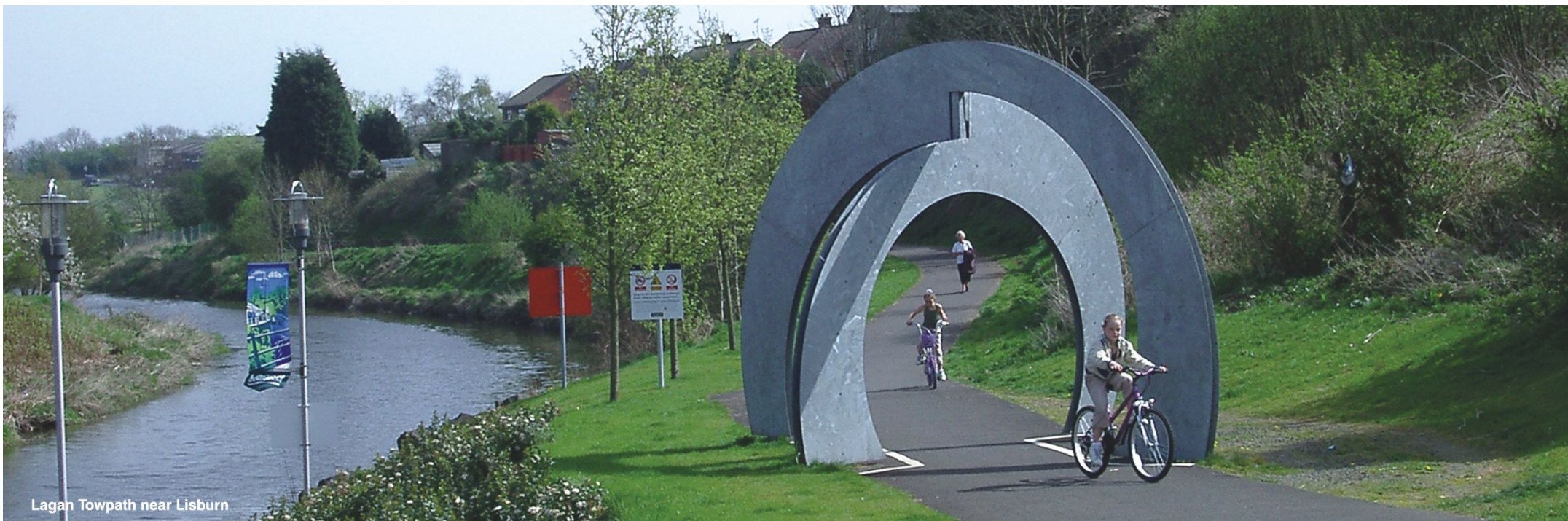
Lagan Towpath near Lisburn