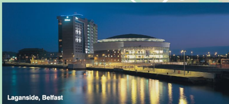
Lagan Side, Belfast