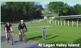
At Lagan Valley Island

Motorbikes are not permitted on traffic free paths. First published 2004. Re-printed with minor changes 2010. © Sustrans. OSNI permit no 60009. © Crown copyright 2010. Map production by Stirling Surveys. Printed by L & S Litho.