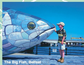
The Big Fish, Belfast