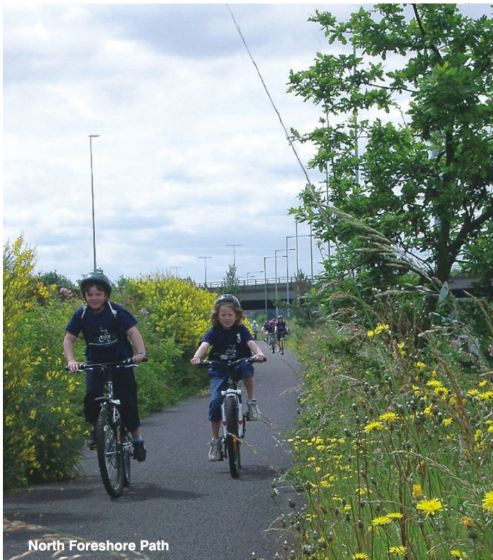
North Foreshore Path

The award winning Lagan and Lough Cycle Way is a twenty-one mile, level, mostly traffic-free cycle ride or walk connecting Lisburn, Belfast and Newtownabbey. The route is suitable for novice and family cyclists of all ages and abilities and passes along the waterside environment of the Lagan Towpath and Belfast Lough. It can be split easily into shorter sections by the use of trains, which carry cycles and there are stations along the route. The Lagan and Lough Cycle Way is a section of the National Cycle Network , a comprehensive network of safe and attractive routes to cycle and walk throughout the UK, linking to routes in the Republic of Ireland. One third of the Network is traffic-free, the rest follows quiet lanes or traffic calmed roads. It is delivered through partnerships with Government Departments, Local Councils and community groups and is co-ordinated by the charity Sustrans. www.sustrans.co.uk